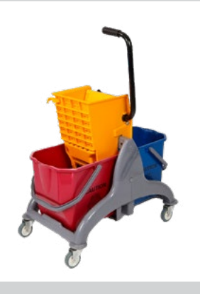
ORION TROLLEY Plastic wringer | 50L capacity