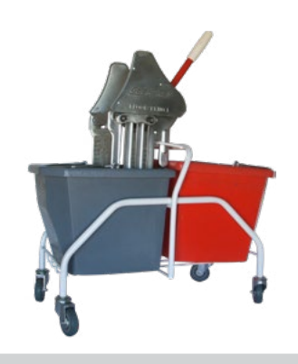
DOUBLE BUCKET TROLLEY Metal wringer | 50L capacity