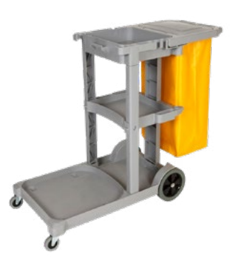
MILLENNIUM TROLLEY Dry trolley