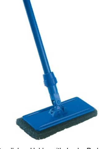
Doodlebug Holder with Jumbo Pads Colours: White | Black | Red