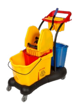
SERVO TROLLEY Plastic wringer | 33L capacity