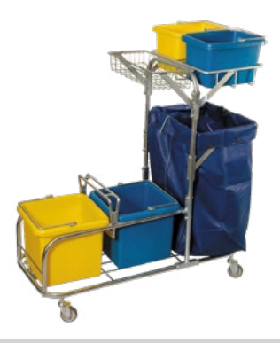
DIRTBUSTER TROLLEY No wringer | 60L capacity