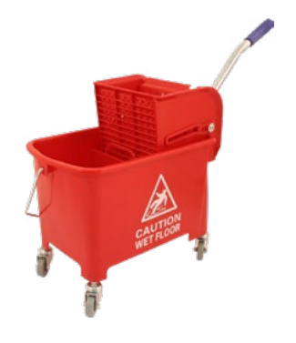
ECONOMY TROLLEY Plastic wringer | 20L capacity